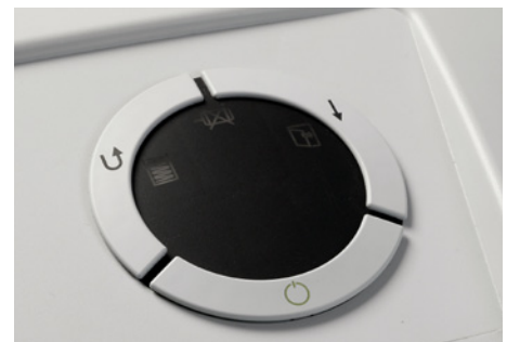
The easy-to-use command dial controls all of the shredder's functions such as power up, reverse, and continuous run.