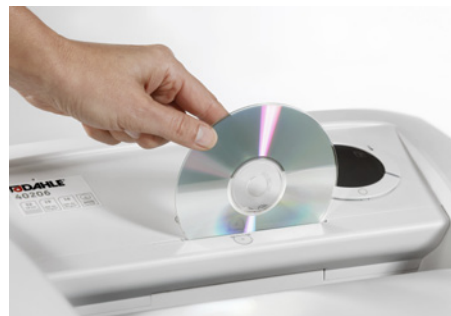
Dahle Professional shredder with built in user-friendly opening for CD/DVD destruction.