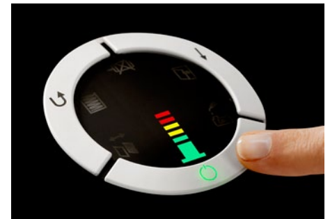
The easy-to-use command dial controls all of the shredder's functions and illuminates the proximity to sheet capacity.