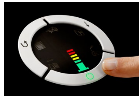
The easy-to-use command dial controls all of the shredder's functions and illuminates the proximity to sheet capacity.