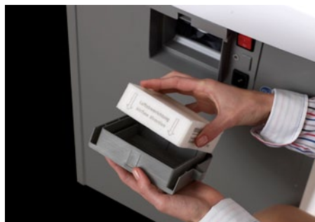
The CleanTEC® filter traps up to 98% of the fine dust, and provides a cleaner, healthier work environment.